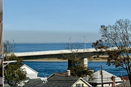
Panoramic Bay & Coastal Views