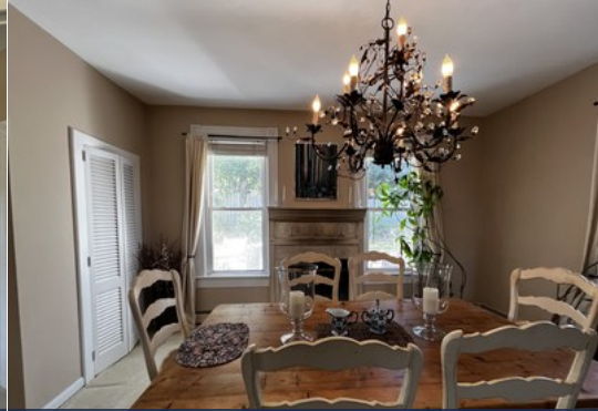
Dining Room · Fireplace