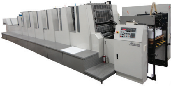
Sakurai Oliver 672 with Coater