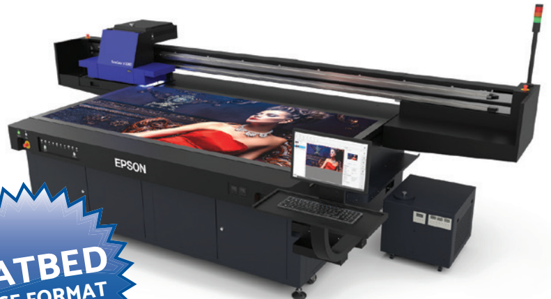
Epson V7000 UV Flatbed

Our large facility houses many pieces of equipment, only some are pictured above. Please do not hesitate