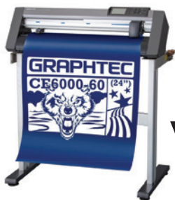
Graphtec Vinyl Cutter