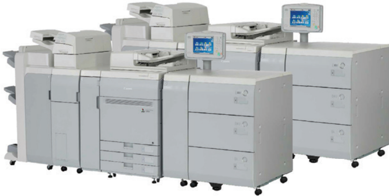
Canon imagePRESS C810 Digital Presses (2)