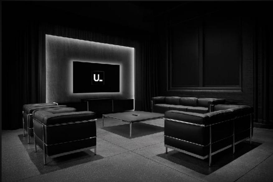
MEDIA LOUNGE | NITE