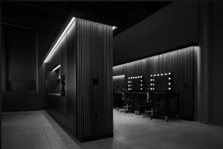
FLEX AREA | NITE