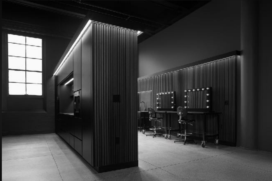
FLEX AREA | DAY