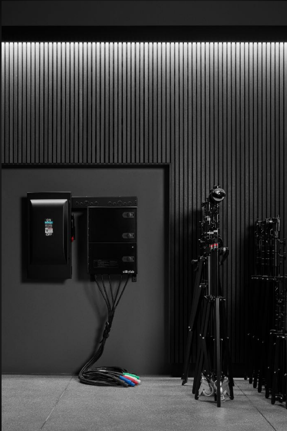
GRIP & ELECTRIC