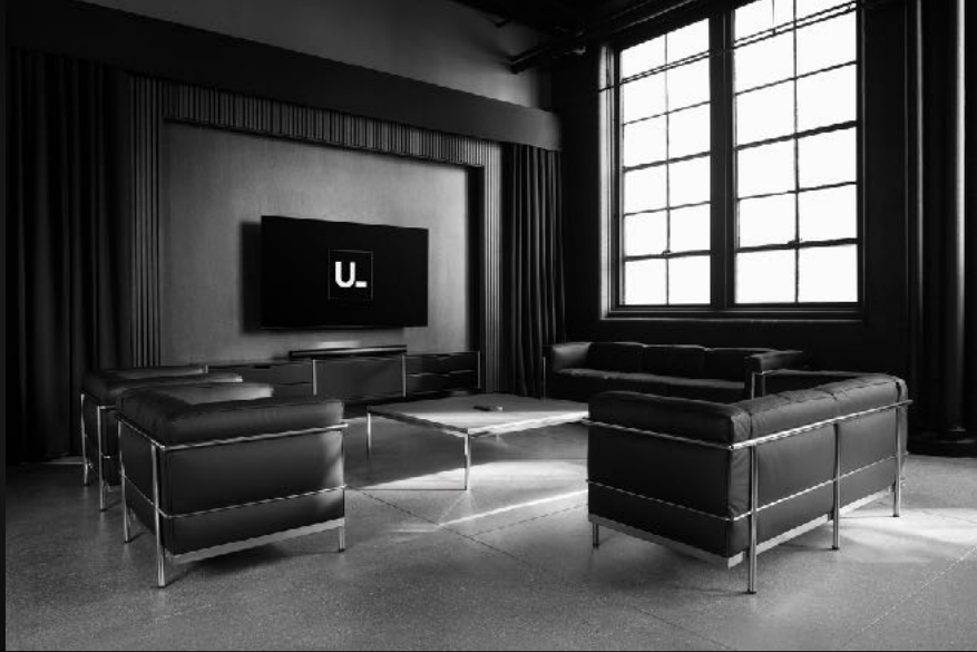
MEDIA LOUNGE | DAY