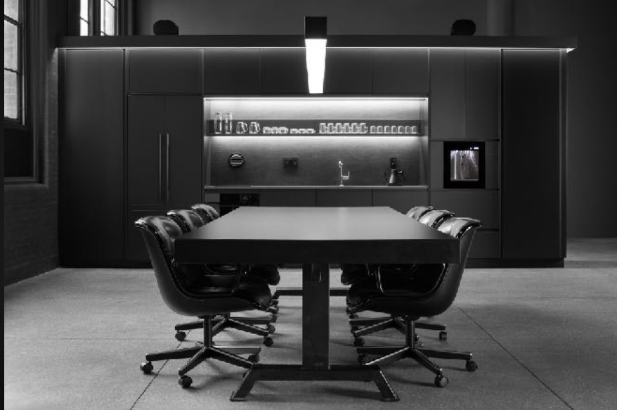
CLIENT AREA | DAY