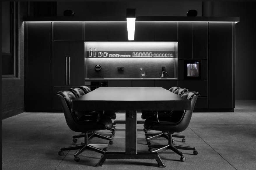
CLIENT AREA | NITE